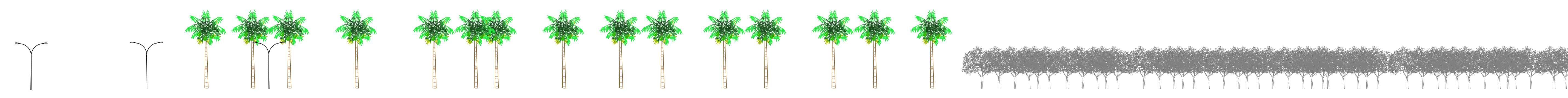
CORTE B-B PARTE 02 ESCALA 1:500